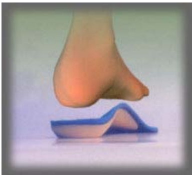
Sole Support Orthotic

In May, 2004 our entire staff participated in an in-house hands on workshop about shoe inserts. Sound like a sleeper? Actually we hired an engineer from Tennessee who is the inventor of a new concept of orthotic. We learned about the theory, design and application of this new technology. We've never seen anything like his products – they are custom foot orthotics that are medical grade shoe inserts. They are fitted and prescribed by a variety of orthopedic medical professionals, including orthopedic surgeons, podiatrists, physical therapists, chiropractors, orthotic and prosthetic specialists and pedorthotists. They are very useful for a number of conditions, but most commonly for fallen arches (flat feet). This is not necessarily a problem in itself, however, it often leads to a number of painful foot deformities such as bunions, corns, and plantar fasciitis. The condition of the arch also affects the posture and proper mechanics of the entire lower leg, pelvis and spine. It is estimated that 90-95% of the human population has some degree of fallen arch.